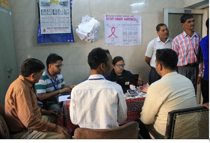
PHIK and nutrition counselling