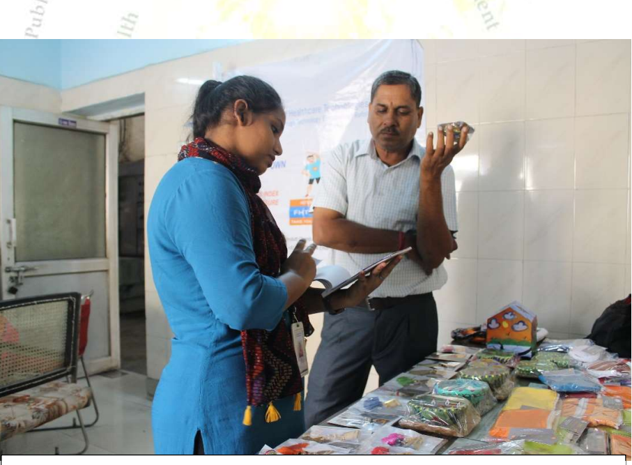
Display of RISE products and distribution of participation certificate