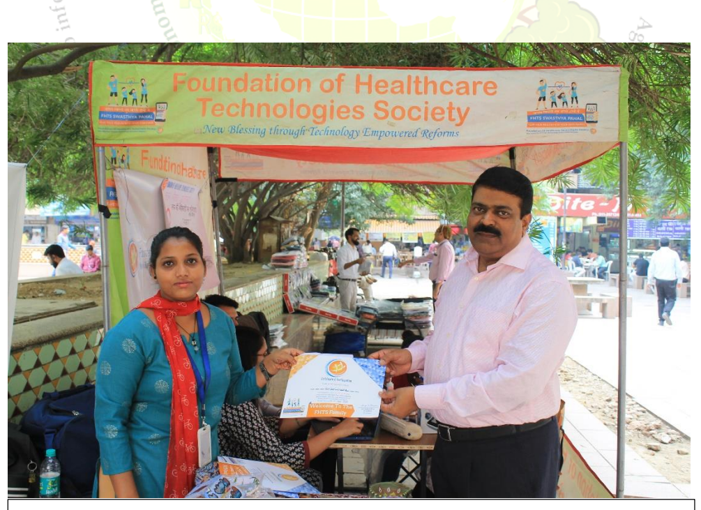
Distribution of participation certificate