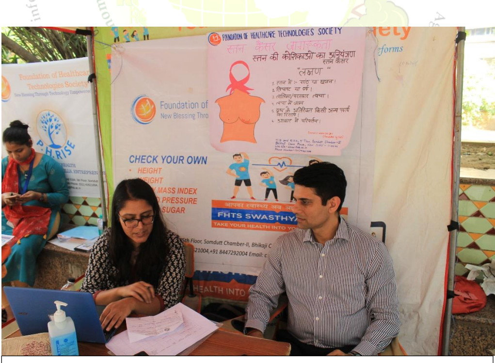
PHIK and nutrition counselling of the beneficiary