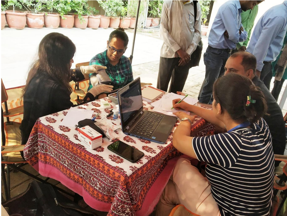
Measurement of blood pressure of one of the beneficiary along with PHIK and diet counselling of another beneficiary at the camp