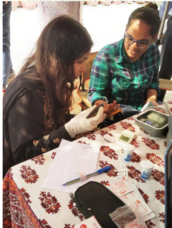
Measurement of blood sugar of one of the beneficiary at the camp