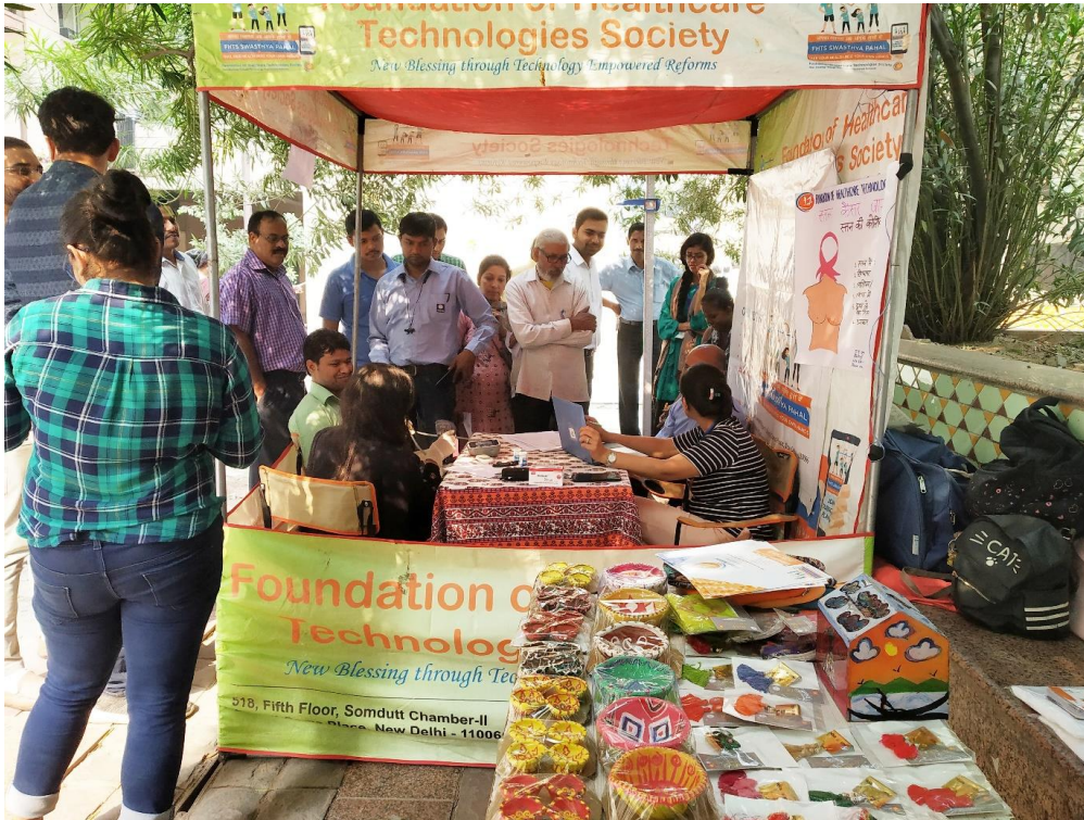
Swasthya Pahal Camp overview – setup at Bhikaji Camp Place