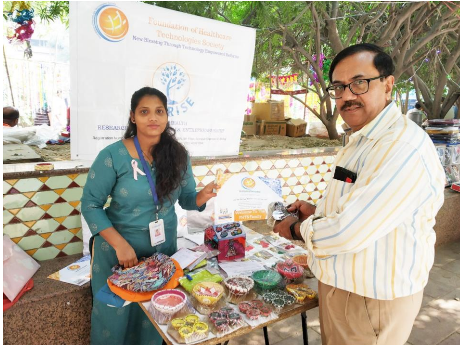
Distribution of participation certificate to one of the beneficiary at the camp