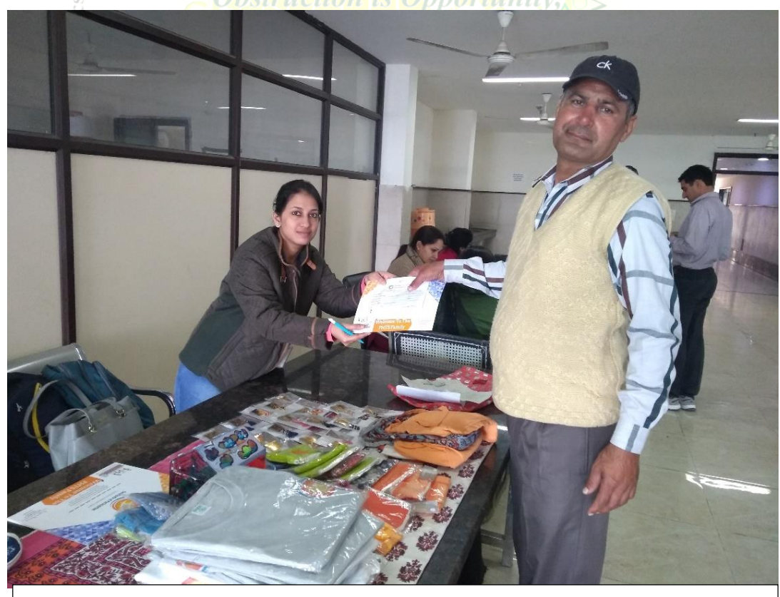
RISE and distribution of certificate of participation to the beneficiaries