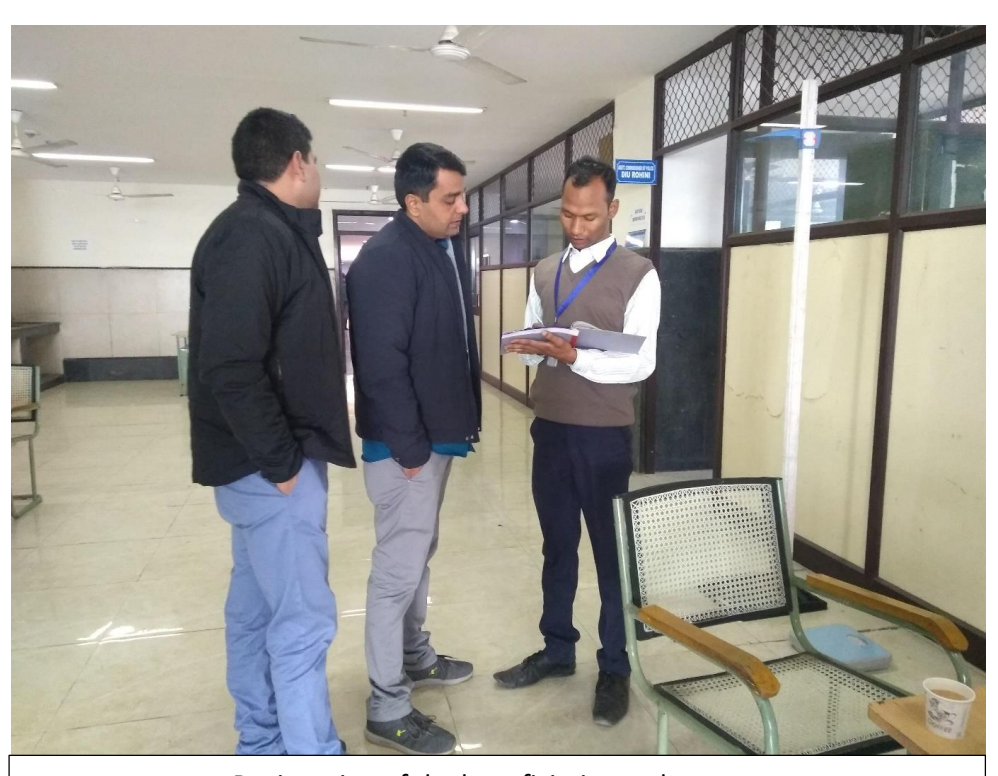
Registration of the beneficiaries at the camp