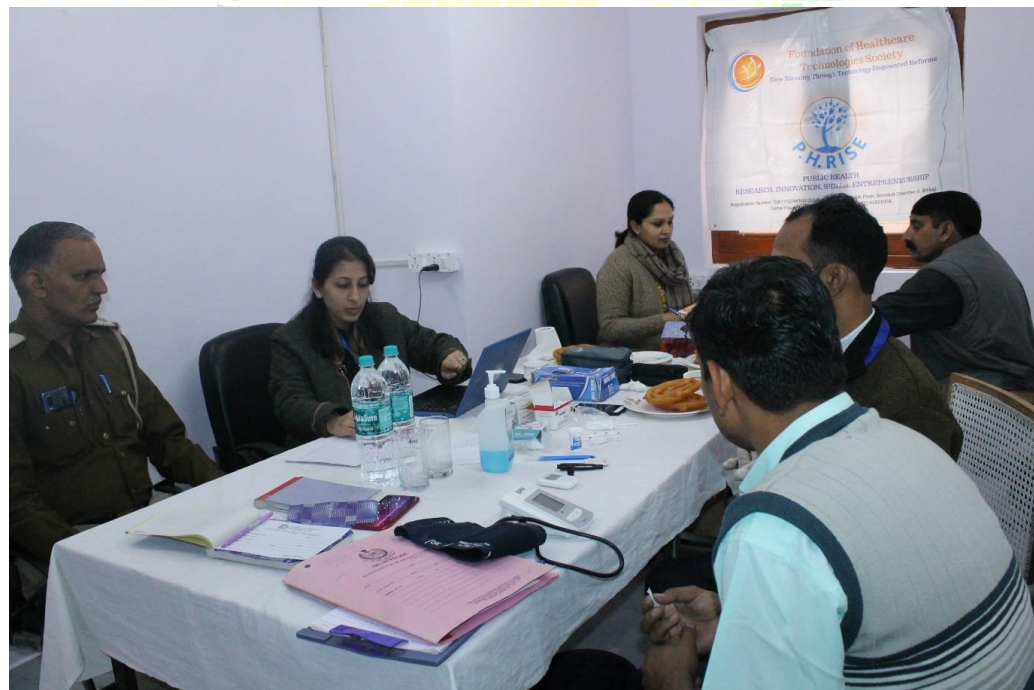
An overview of the Swasthya Pahal camp at Kanjhawala Police Station