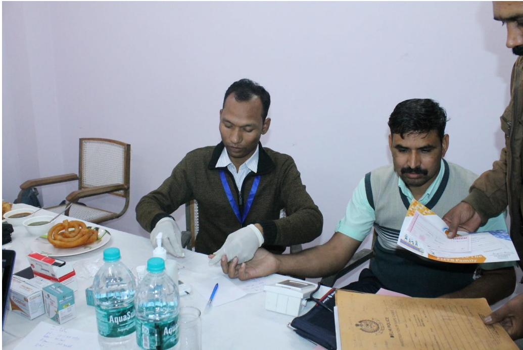
Blood sugar measurement of the beneficiary at the camp