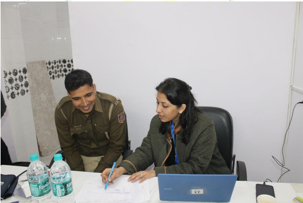
PHIK and nutrition counselling of the beneficiary at the camp