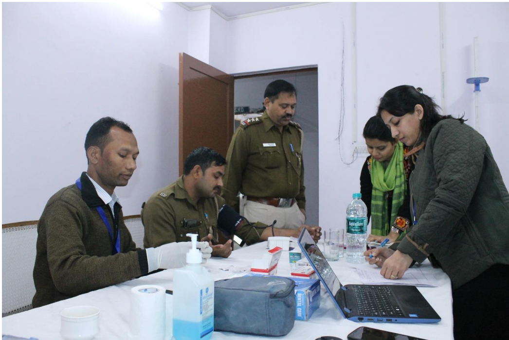
Registration of the beneficiaries