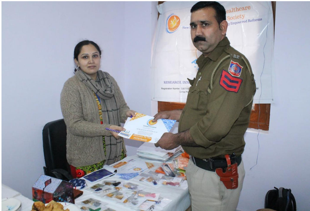
RISE and distribution of certificate of participation to the beneficiary