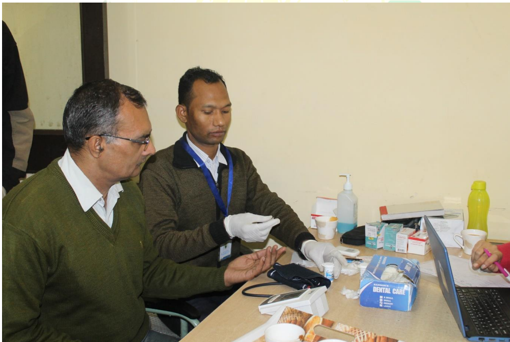
Measurement of blood sugar of the beneficiary at the camp