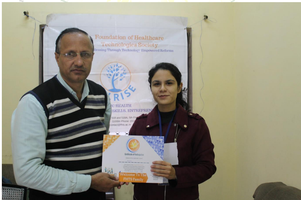
Distribution of certificate of participation to the beneficiary