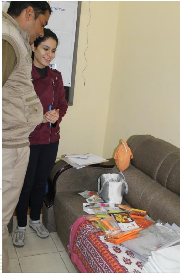
RISE during the swasthya pahal camp