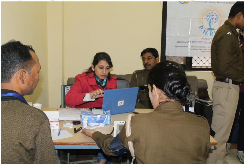
Overview of the camp at Budh Vihar Police Station