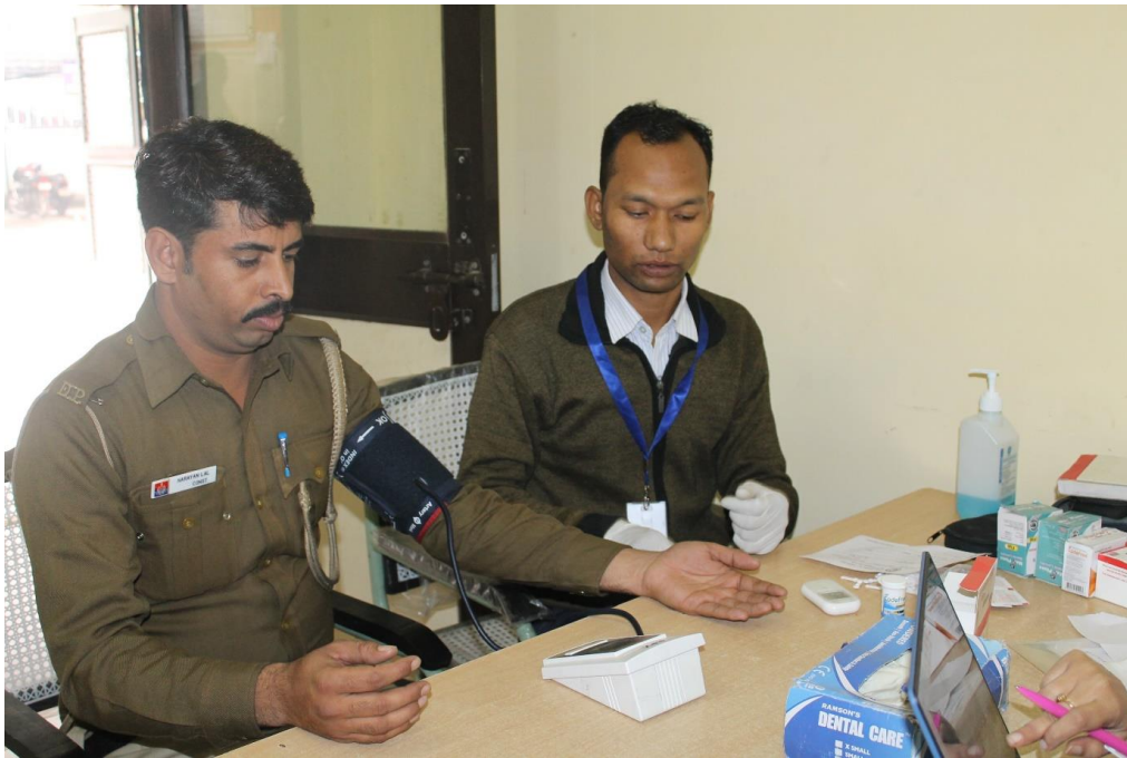
Measurement of blood pressure of the beneficiary at the camp