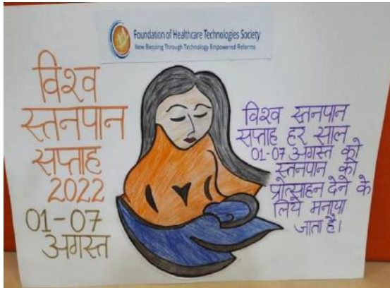
Poster 1: Importance of world breastfeeding day