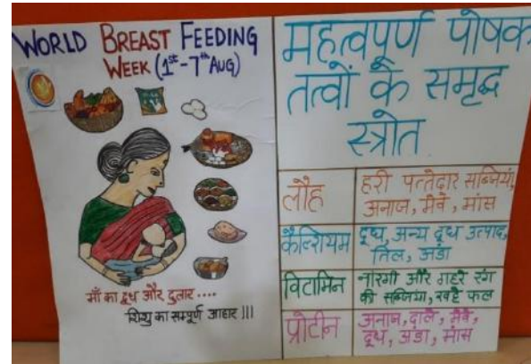
Poster 2: Important nutrients and their food source