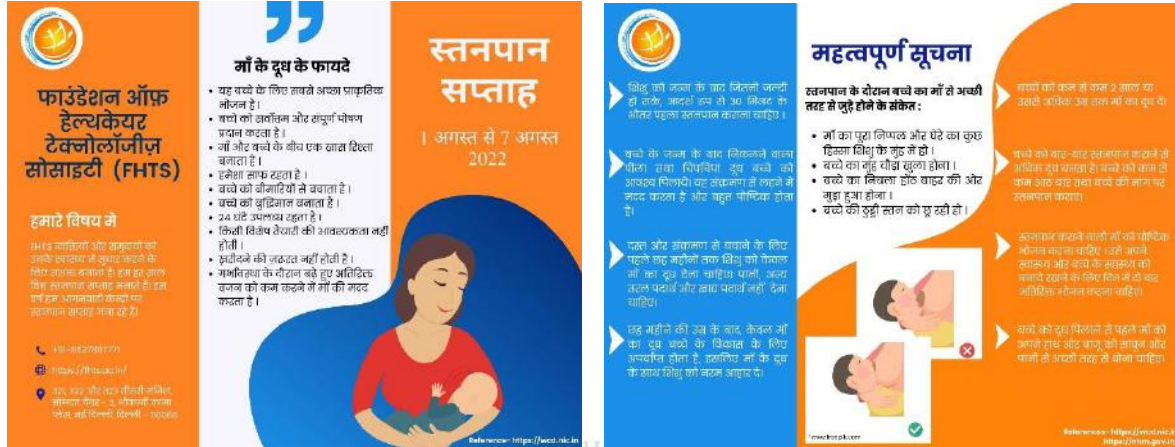
Page 2: Importance of breastmilk