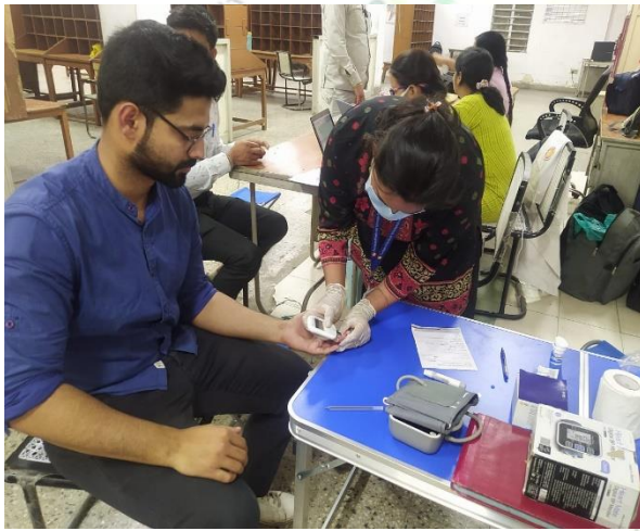
Picture3: Measurement of Blood Sugar