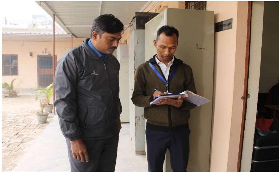
Registration of the beneficiary at the camp