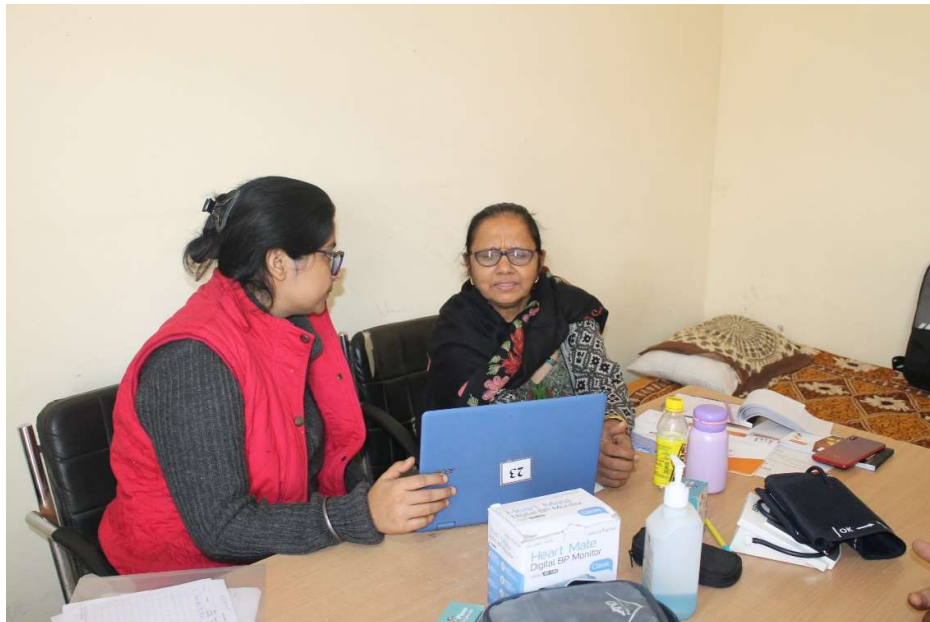
PHIK and nutrition counselling of the beneficiary