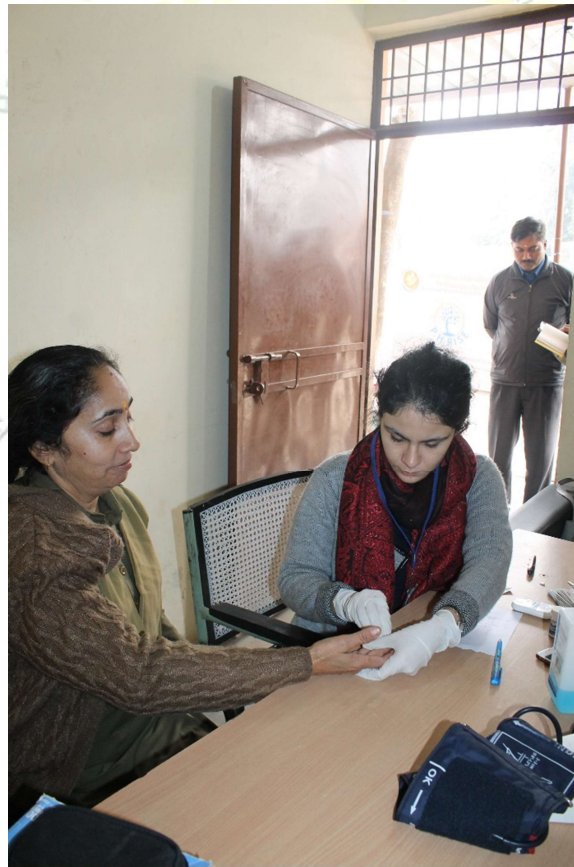
Measurement of blood sugar of the beneficiary