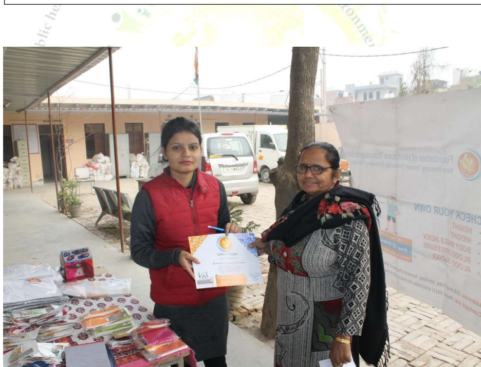
RISE and distribution of certificate of participation