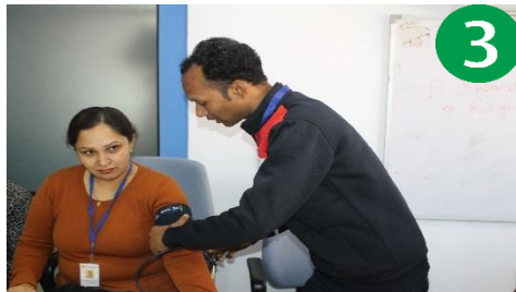
Measuring blood pressure