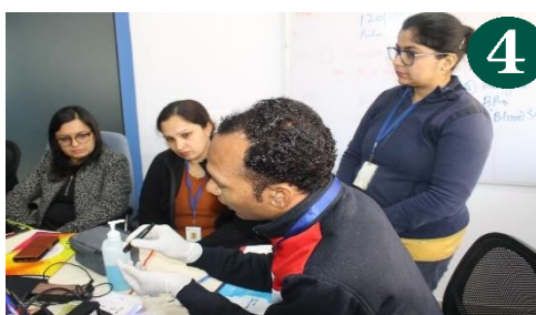
Measuring blood sugar