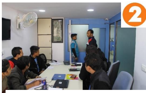
Anthropometry: Height and Weight