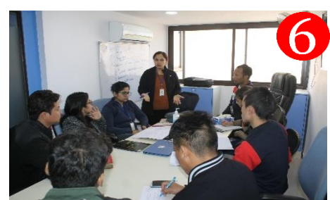
Urban slum projects