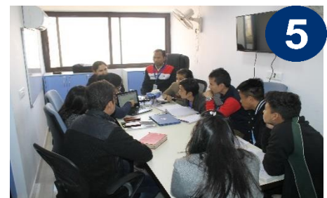
Use of PHIK